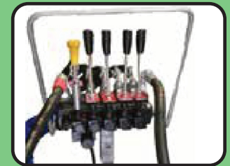
Standard Manual Control