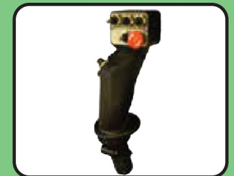
Optional Electric Joystick (Req. Tractor w/ Cab)